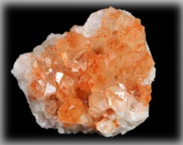
Specimen sizes: 1" x 1" to 3" x 5" Price range: $15.00- $80.00, $120.00

The selection that we have range from smaller sharply formed crystals to numerous large and sharply formed crystals that are intertwined to create an attractive composition.