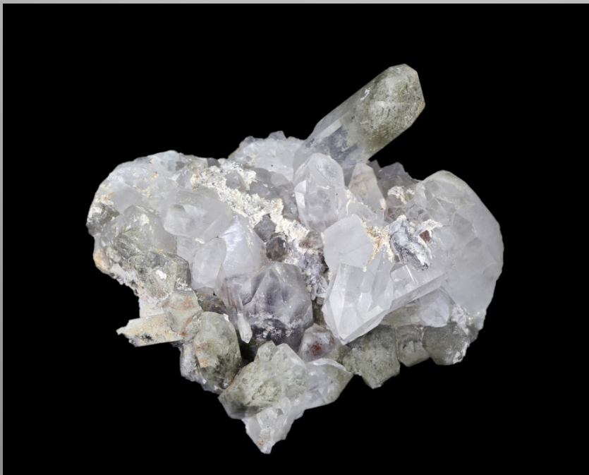
Specimen sizes: 1.5" x 2.5" to 2.5" x 4" Price range: $30.00- $60.00

Collected in China, these specimens have a distinct reddish color that is rare in macrocrystalline quartz. They consist of clusters of well-developed, semi-transparent, hexagonal crystals with perfect pyramidal terminations. All of these crystals are included and lightly coated with particulate hematite to create their delightful reddish color. The black hematite makes for a nice contrast that causes the colors to pop.