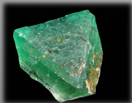
Specimen sizes: 2" x 2" to 2.5" x 2.5" Price ranges: $35.00 to $80.00

These orange quartz clusters are from Minas Gerais, Brazil which is a classic locality for the quartz family. The transparent crystals color ranges from a light tangerine to a deeper red-ish orange sitting atop milky quartz. Phantom quartz meaning that a ghost-like crystal formed within the main crystal.