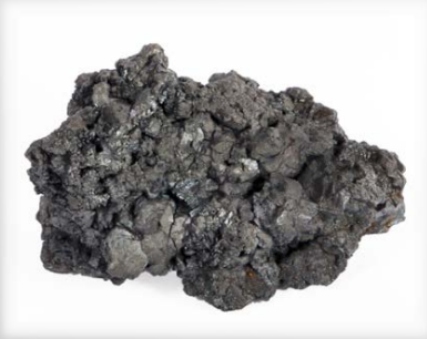
Specimen sizes: .75" x 1" to 1.25" x 2" Price range: $35.00- $75.00