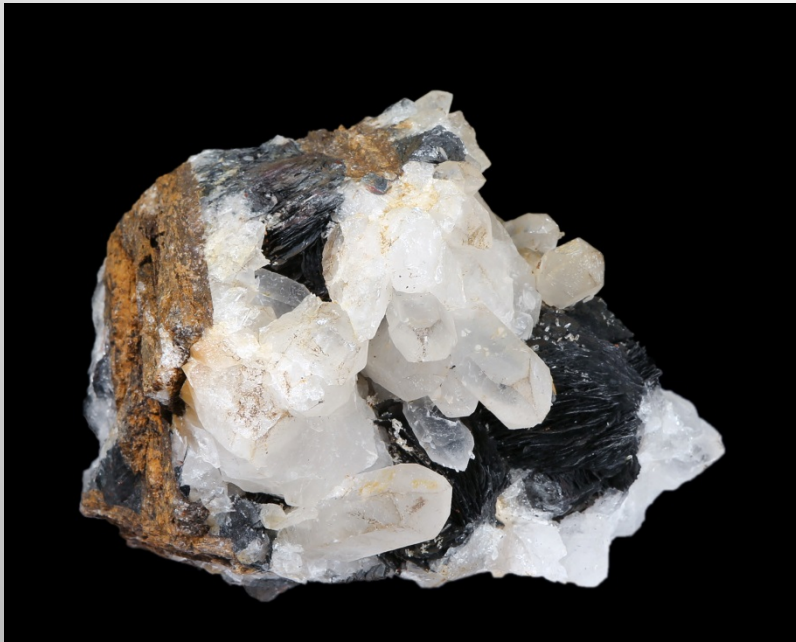
Specimen sizes: 2" x 2" to 2" x 3" Price range: $40.00- $65.00