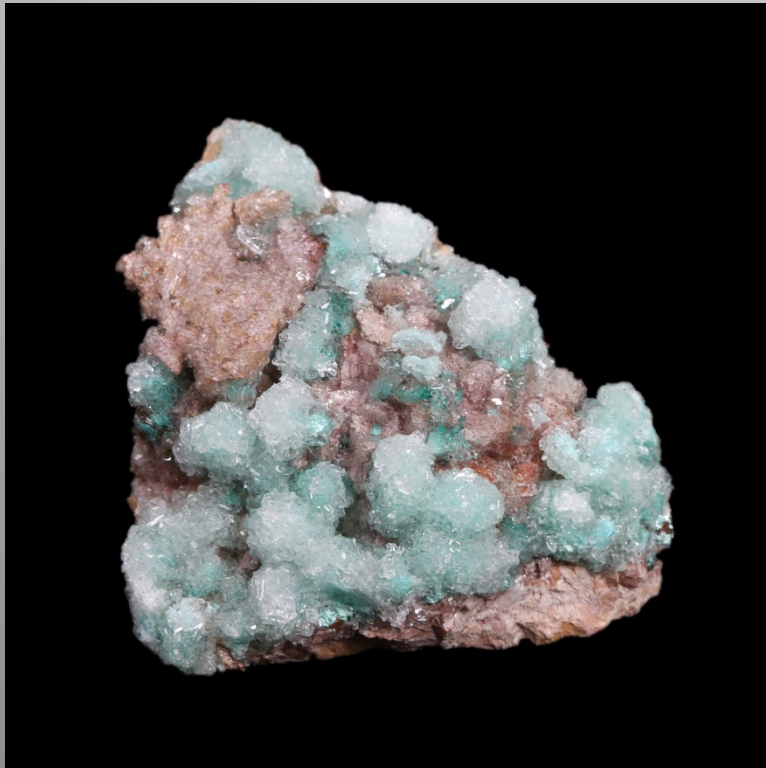
Specimen sizes: 1.5" x 2.5" to 3" x 7.5" Price ranges: $35.00-$135.00

Agatized coral is the official state stone of Florida. These specimens, which are actually fossil pseudo morphs of quartz after aragonite, were collected from a classic locality—Florida's Withlacoochee River. All specimens exhibit features of the original coral along with drusy crystals of colorless quartz; all are cut and polished to fully display their range of rich colors that include browns, blacks, yellows, and reds. Please let us know if you prefer lighter or darker coloring.