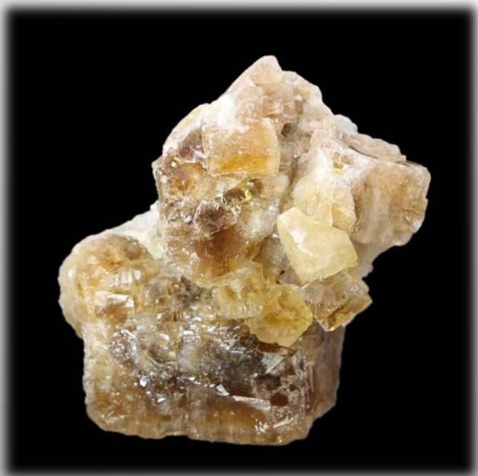
Specimen sizes: 1.5" x 3" to 2" x 3" Price: $90.00 to $175.00