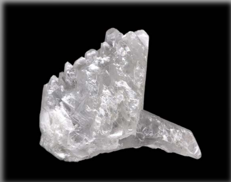
Specimen sizes: 2" x 3" to 3" x 4.5" Price $25.00 to $50.00

These beautiful composite specimens, collected from the classic fluorite locality at Clay Center, Ohio, consist of prominently color-zoned, sharp cubes of transparent, "root-beer"-colored fluorite, or calcium fluoride, in association with white blades of celestine, or strontium sulfate. These specimens are fine display pieces and make an excellent study in contrasting colors and crystal structures.