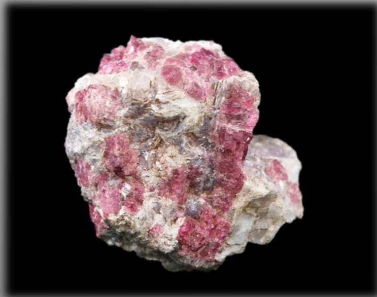
Specimen sizes: 1" x 1" to 2.5" x 4" Prices: $20.00 to $45.00

There is a drusy coating of crystals and many have a luster so intense that they almost look as if they were wet.