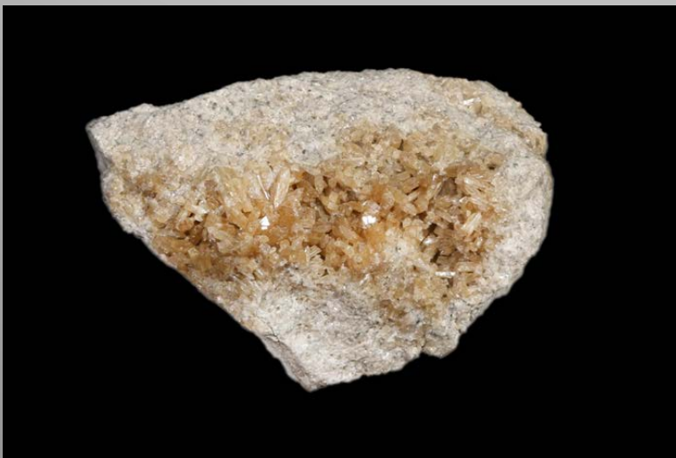
Specimen sizes: 1" x 1.5" to 3" x 3.5" Price $15.00- $75.00

These specimens of wavellite, or basic hydrous aluminum fluorophosphate, are from Mauldin Mountain in Montgomery County, Arkansas, the premier wavellite locality in the United States. Wavellite is present as thick, botryoidal coatings of hemispherical aggregates with a pale, lime-green color. The wavellite contrasts nicely against a matrix of dark Big Fork Chert.