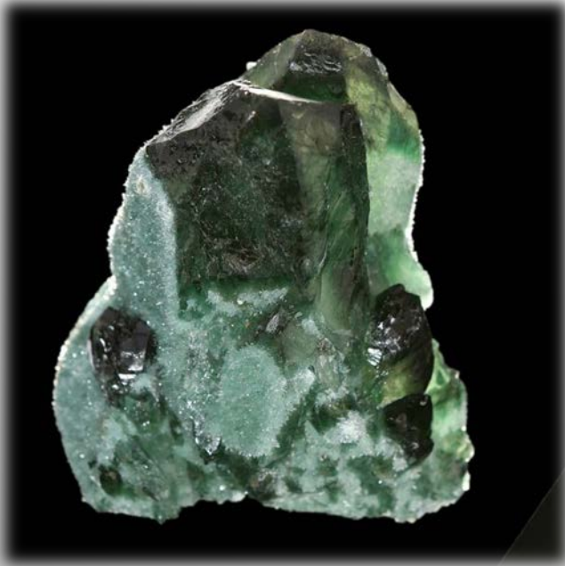
Specimen sizes: 2.5" x 5" to 3" x 6" Prices: $90.00 to $275.00