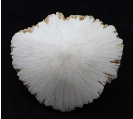
Specimen sizes: 3.0" x 3.5" to 4" x 4.5" Price: $45.00- $75.00

*Starting next month, previous monthly offerings will be available in our Etsy Shop at www.etsy.com/shop/CelestialEarth7 *