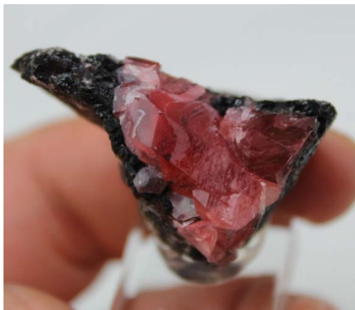
Specimen size: 1.0" x 1.0" to 1.0" x 1.75" Price range: $45.00 to $175.00

Collected at the Kaiwu Mine in Guizhou Province, China, these are composite specimens of siderite, or iron carbonate, and chalcopyrite, or copper iron sulfide. The brass-yellow, tetrahedral crystals of chalcopyrite, which show a metallic luster and a flash of iridescence, are nestled among the translucent, olive-green, bladed crystals of siderite.