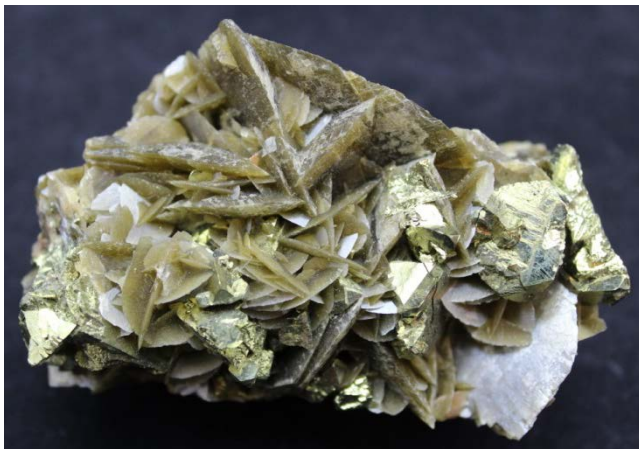
Specimen size: 1.0" x 2.0" to 3.0" x 4.0" Price range: $45.00 to $125.00

These unusual forms of the zeolite-mineral scolecite, or hydrous calcium aluminum silicate, are from the basalt formations of the Deccan Traps in Maharashtra, India. They consist of structures of radiating clusters of acicular crystals that have been shaped into "domes"; the base of these specimens have been smoothed and polished to a high luster to display intricate, linear patterns of white and buff colors.